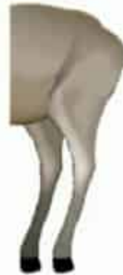
The other half