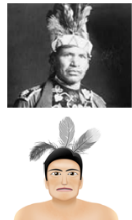
Figure 1.1 Fish Lake Female Character. Left: "Ojibwe Woman" (1885). Center: Anookwesens. Generation Games 2D Artwork (Flores 2015). Right: 7 Generation Games 3D Female Avatar (Taylor 2015). Figure 1.2 Fish Lake Male Character. Top: "Full Blood Chippewa Man" (1918). Bottom: "Male Character 1." 7 Generation Games Artwork (Flores 2015).

Recognizing the fact that early photographs of Native peoples, even those in "traditional dress" or "traditional settings," are portrayed through the lens of non-Native photographers with explicit and implicit bias, including at times in a conscious effort to portray Indians in Western European styles (Copway 1850), cultural experts were consulted on character clothing,